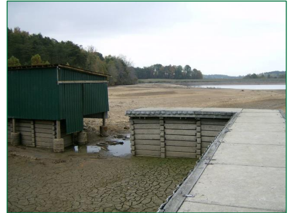
Lake Higgins Marina - 2007 Drought