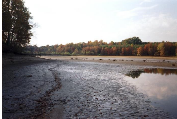
Lake Townsend Shoreline - 1998 Drought