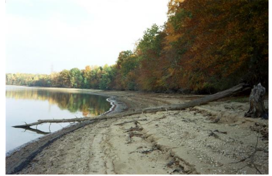
Lake Townsend Shoreline - 1998 Drought