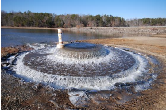
Terminus of Haw River (Water) Transfer Line at Lake Townsend