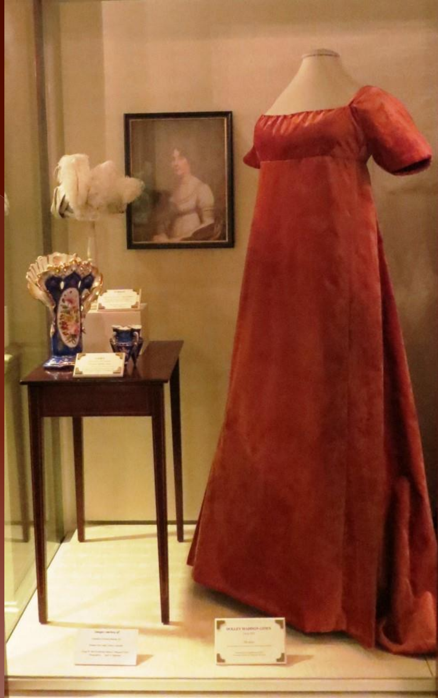
Image courtesy of The Metropolitan Museum of Art The Costume Institute The Met Cloak Room The Met Cloak Room The Met Cloak Room

DALEY HARRIS LINES 1840s The Met Cloak Room The Met Cloak Room The Met Cloak Room