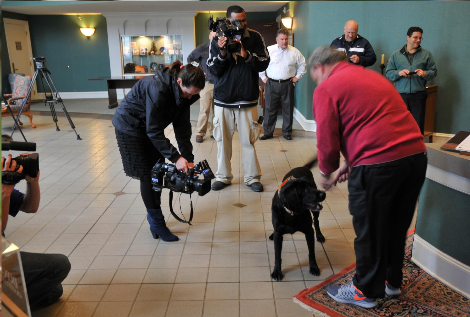
2015 Babe's Bat