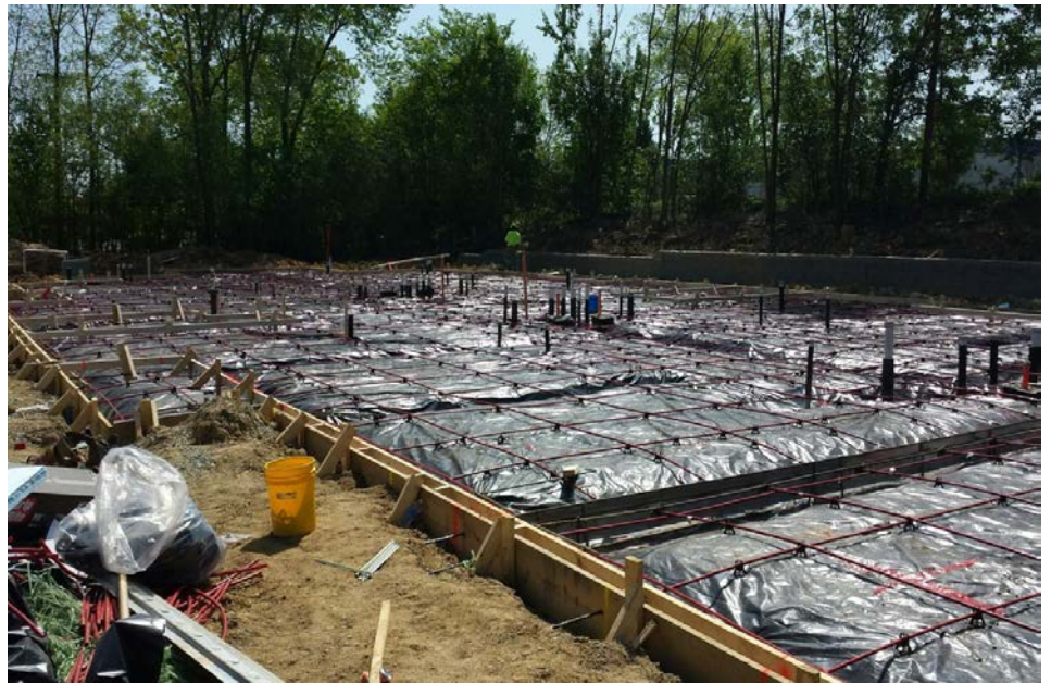
Post tension slab construction at Hope Court