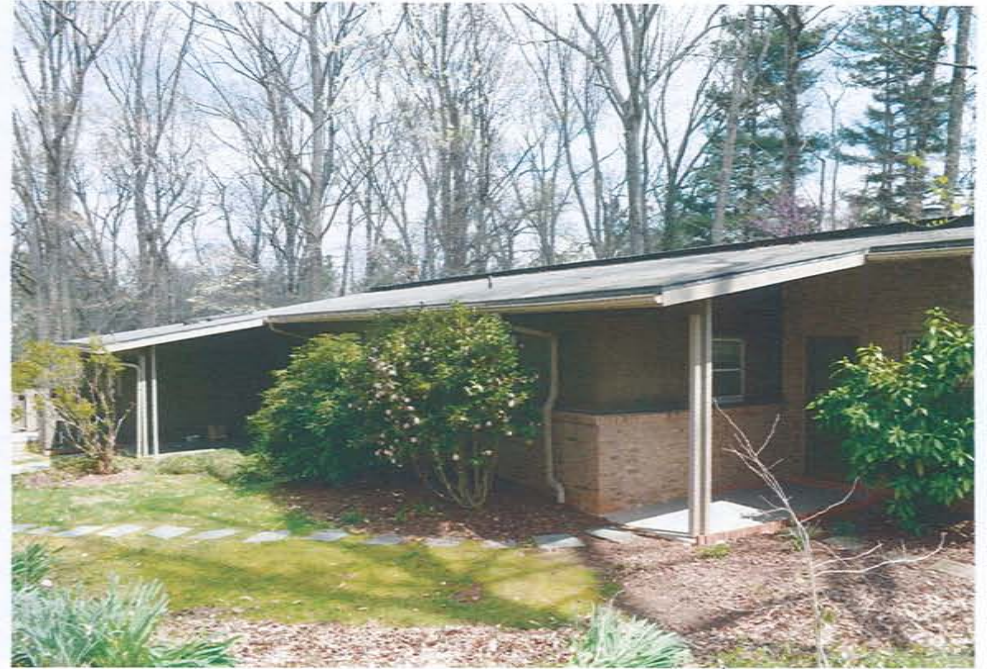
Entrance - Side elevation